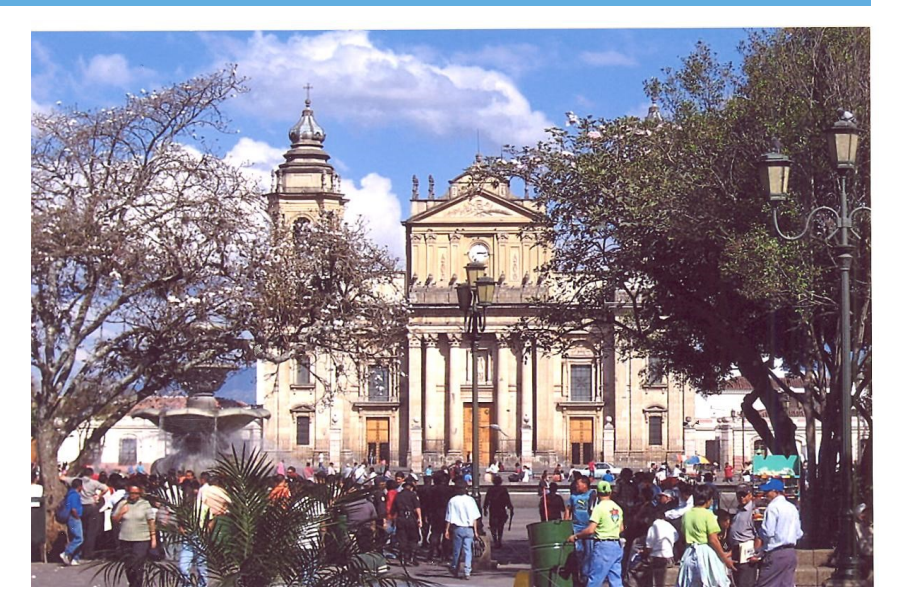
Cathedral in Guatemala City.

Part-time or accelerated students pay by credit hour. Full-time students pay by credit hour for any overload credits.